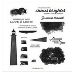
Lighthouse Point Photopolymer Stamp Set (English) - 158901