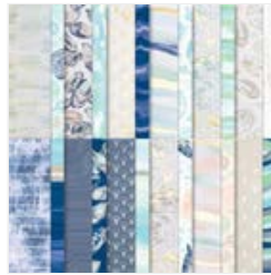
By The Bay 6" X 6" (15.2 X 15.2 Cm) Specialty Designer Series Paper - 160434