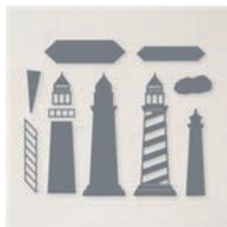
Lighthouse Dies - 158906