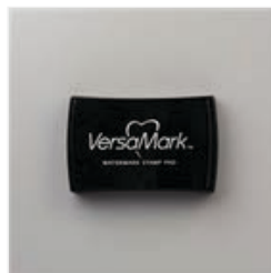
Versamark Pad - 102283