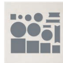
Stylish Shapes Dies - 159183