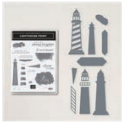
Lighthouse Point Bundle (English) - 158907

Tami White tami@stampwithtami.com www.stampwithtami.com