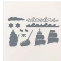
On The Ocean Dies - 160774