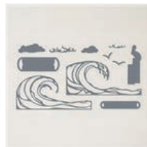
Waves Dies - 158840