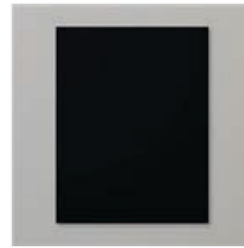
Basic Black 8-1/2" X 11" Cardstock - 121045