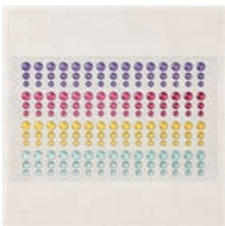
Glossy Dots Assortment - 158827