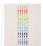
2022-2024 In Color Matte Decorative Dots - 159186