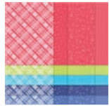
2022-2024 In Color™ 6" X 6" (15.2 X 15.2 Cm) Designer Series Paper - 159253