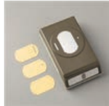
Label Me Fancy Punch - 151297