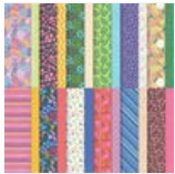
Flowers & More 12" X 12" (30.5 X 30.5 Cm) Host Designer Series Paper - 160802