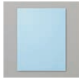
Balmy Blue 8-1/2" X 11" Cardstock - 146982