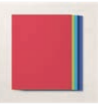
2022-2024 In Color™ 8-1/2" X 11" Cardstock - 159204