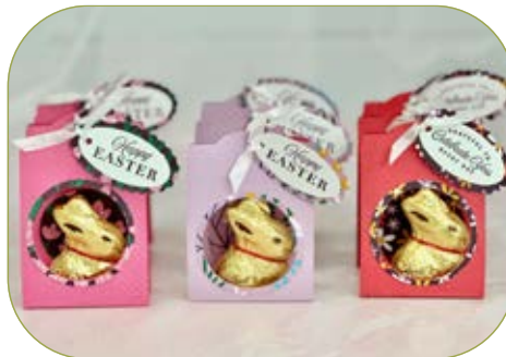
TAG BUNNY BOXES