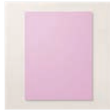
Fresh Freesia 8- 1/2" X 11" Cardstock - 155613