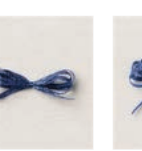
Starry Sky 1/8" (3.2 Mm) Metallic Woven Ribbon - 159198