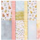
Rain Or Shine Specialty 12" X 12" (30.5 X 30.5 Cm) Designer Series Paper - 160540