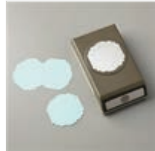
Label Me Lovely Punch - 151296