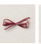
Sweet Sorbet 1/8" (3.2 Mm) Metallic Woven Ribbon - 159200