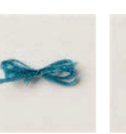
Tahitian Tide 1/8" (3.2 Mm) Metallic Woven Ribbon - 159197