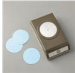
2" (5.1 Cm) Circle Punch - 133782