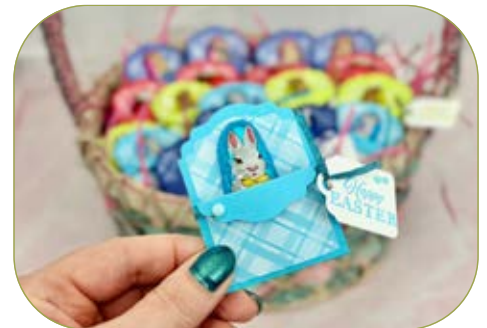
IN COLOR BUNNY HOLDERS

*Note I designed the original with the Celebration Tag dies which had retired so I will show how to make without the die.