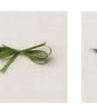
Parakeet Party 1/8" (3.2 Mm) Metallic Woven Ribbon - 159196