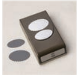
Double Oval Punch - 154242