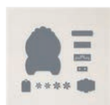
Pretty Pillowbox Dies - 156321