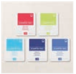
2022-2024 In Color Classic Stampin' Pads - 161108