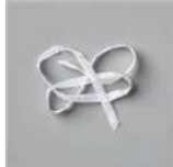
Whisper White 1/4" (6.4 Mm) Crinkled Seam Binding Ribbon - 151326