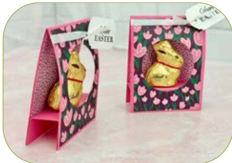
TENT TREAT BUNNY BOXES