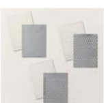
Basics 3D Embossing Folders - 161598