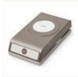
1-3/4" (4.4 Cm) Circle Punch - 119850