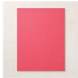
Sweet Sorbet 8- 1/2" X 11" Cardstock - 159268