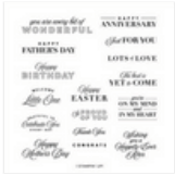
Celebrating You Cling Stamp Set (English) - 158028

Tami White tami@stampwithtami.com www.stampwithtami.com