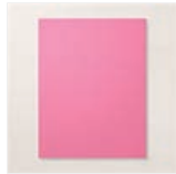
Polished Pink 8- 1/2" X 11" Cardstock - 155710