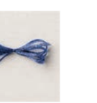
Orchid Oasis 1/8" (3.2 Mm) Woven Metallic Ribbon - 159199