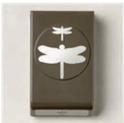
Dragonflies Punch - 154240

Since the Lucky Clover punch isn't available try substituting with the Dragonflies punch.