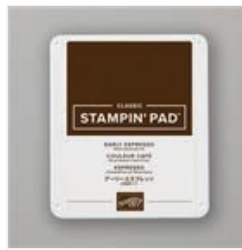
Early Espresso Classic Stampin' Pad - 147114