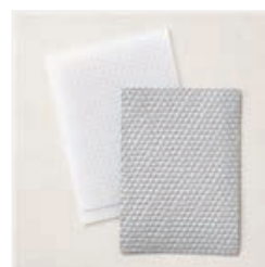
Hive 3D Embossing Folder - 157955