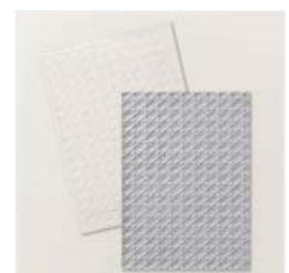
Cane Weave 3D Embossing Folder - 160580