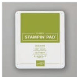
Old Olive Classic Stampin' Pad - 147090