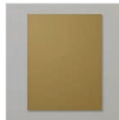
Soft Suede 8- 1/2" X 11" Cardstock - 115318