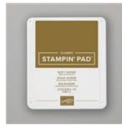
Soft Suede Classic Stampin' Pad - 147115