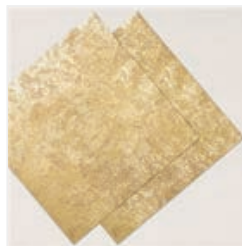
Distressed Gold 12" X 12" (30.5 X 30.5 Cm) Specialty Paper - 159237