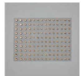
Champagne Rhinestone Basic Jewels - 151193