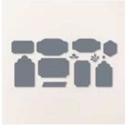
Something Fancy Dies - 160424