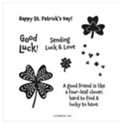
Lucky Clover Cling Stamp Set (English) - 160610

Tami White tami@stampwithtami.com www.stampwithtami.com