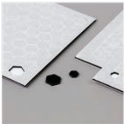
Black Stampin' Dimensionals Combo Pack - 150893