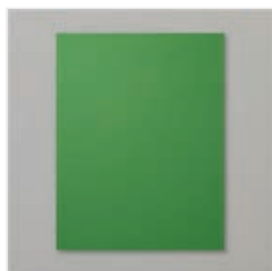
Garden Green 8- 1/2" X 11" Cardstock - 102584