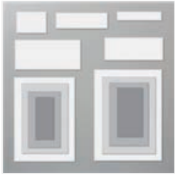
Rectangle Stitched Dies - 151820

Tami White tami@stampwithtami.com www.stampwithtami.com