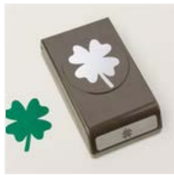
Lucky Clover Punch - 160612