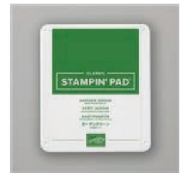
Garden Green Classic Stampin' Pad - 147089