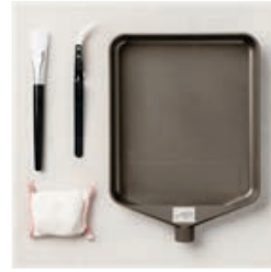
Embossing Additions Tool Kit - 159971