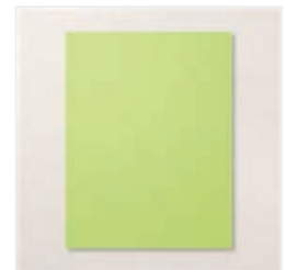
Parakeet Party 8- 1/2" X 11" Cardstock - 159259