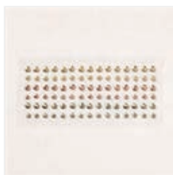
Brushed Metallic Adhesive Backed Dots - 156506