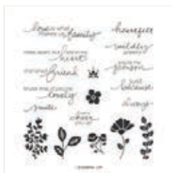
Lovely You Cling Stamp Set (En) - 152525

Tami White tami@stampwithtami.com www.stampwithtami.com