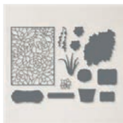
Potted Succulents Dies - 154330