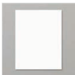
Basic White 8-1/2" X 11" Thick Cardstock - 159229