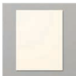
Very Vanilla 8-1/2" X 11" Thick Cardstock - 144237