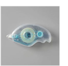
Stampin' Seal -152813