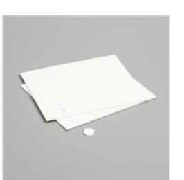
Stampin' Dimensionals -104430