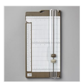
Paper Trimmer -152392

Tami White tami@stampwithtami.com www.stampwithtami.com