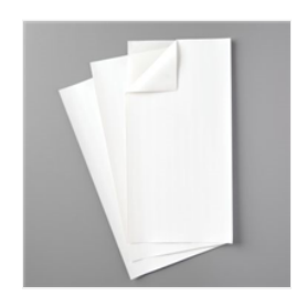
Adhesive Sheets -152334