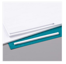
Foam Adhesive Strips - 141825