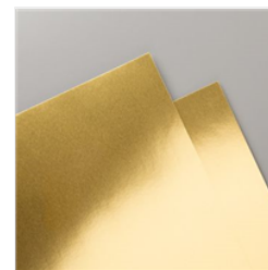
Gold Foil Sheets - 132622