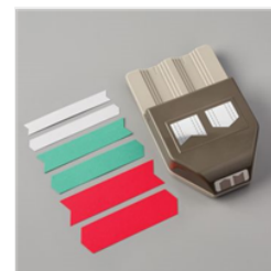
Banners Pick A Punch - 153608