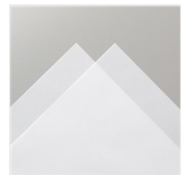
Vellum 8-1/2" X 11" Cardstock - 101856