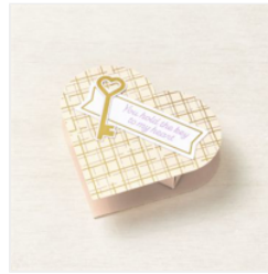
Heart Boxes - 162417