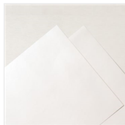
Pearlescent Specialty Paper - 154291