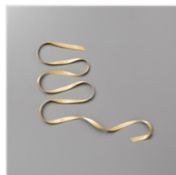
Gold 1/4" (6.4 Mm) Shimmer Ribbon - 152156