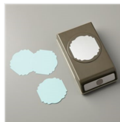
Label Me Lovely Punch - 151296