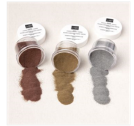
Metallics Embossing Powders - 155555