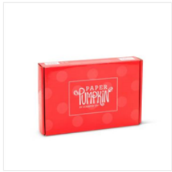
Prepaid Paper Pumpkin Subscription 1- Month - 137858

Tami White tami@stampwithtami.com www.stampwithtami.com