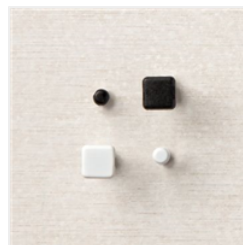
Round & Square Brads - 155570