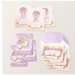
Key To My Heart Paper Pumpkin Refill - 162472