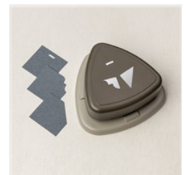
Very Best Trio Punch - 159878