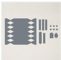
Cracker & Treat Box Dies - 159182