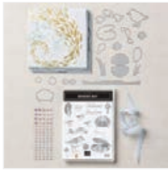
By The Bay Suite Collection (English) - 160450

Tami White tami@stampwithtami.com www.stampwithtami.com