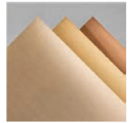
Brushed Metallic Cardstock - 153524