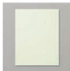
Soft Sea Foam 8- 1/2" X 11" Cardstock - 146988