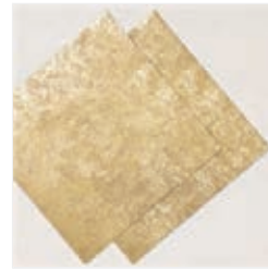
Distressed Gold 12" X 12" (30.5 X 30.5 Cm) Specialty Paper - 159237