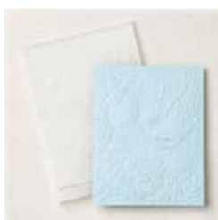
Seashells 3D Embossing Folder - 154309