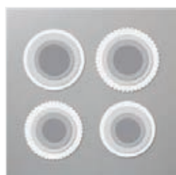
Layering Circles Dies - 151770