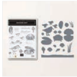
Seaside Bay Bundle (English) - 160445