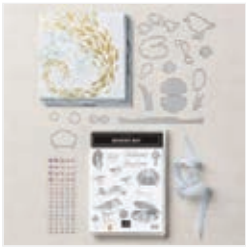
By The Bay Suite Collection (English) - 160450

Tami White tami@stampwithtami.com www.stampwithtami.com