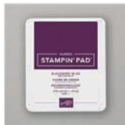
Blackberry Bliss Classic Stampin' Pad - 147092