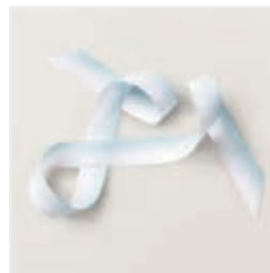
Balmy Blue/White 1/2" (1.3 Cm) Variegated Ribbon - 160448