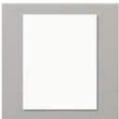
Basic White 8-1/2" X 11" Cardstock - 159276