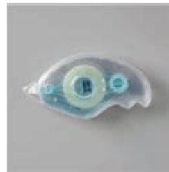
Stampin' Seal - 152813