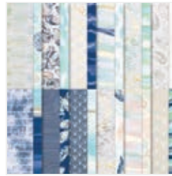
By The Bay 6" X 6" (15.2 X 15.2 Cm) Specialty Designer Series Paper - 160434