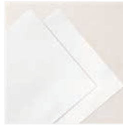
Snowy White 12" X 12" (30.5 X 30.5 Cm) Velvet Sheets - 156405