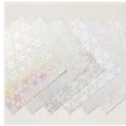
Snowflake 12 X 12 (30.5 X 30.5 Cm) Specialty Vellum - 159832