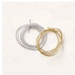
Simply Elegant Trim - 155766