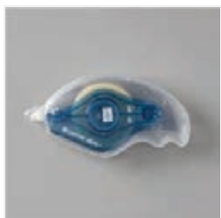
Stampin' Seal+ - 149699