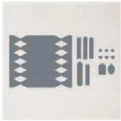
Cracker & Treat Box Dies - 159182

Tami White tami@stampwithtami.com www.stampwithtami.com