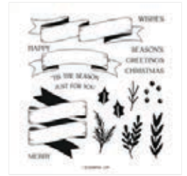
Christmas Banners Photopolymer Stamp Set (English) - 159570