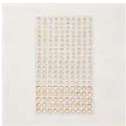
Iridescent Rhinestones Basic Jewels - 158130