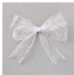
1-1/2" (3.8 Cm) Metallic Mesh Ribbon - 153550