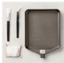
Embossing Additions Tool Kit - 159971