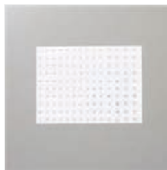
Rhinestone Basic Jewels - 144220