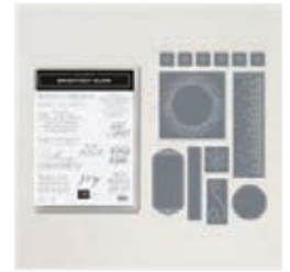
Brightest Glow Bundle (English) - 159552