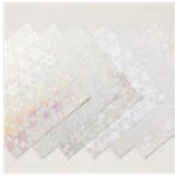
Snowflake 12 X 12 (30.5 X 30.5 Cm) Specialty Vellum - 159832

Tami White tami@stampwithtami.com www.stampwithtami.com