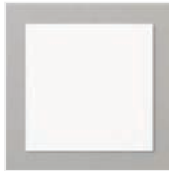
Basic White 12X12 (30.5 X 30.5 Cm) Cardstock - 159231