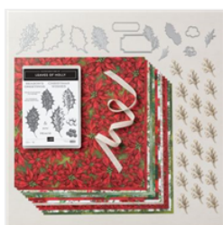
Boughs Of Holly Suite Collection (English) - 159612

Tami White tami@stampwithtami.com www.stampwithtami.com