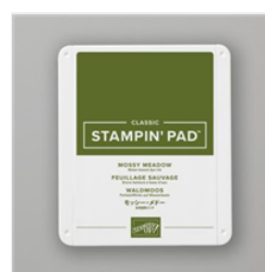
Mossy Meadow Classic Stampin' Pad - 147111