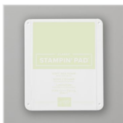
Soft Sea Foam Classic Stampin' Pad - 147102