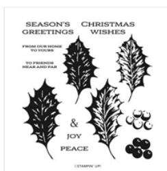
Leaves Of Holly Photopolymer Stamp Set (English) - 159601