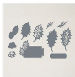
Holly Berry Dies - 159607