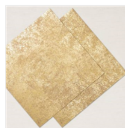
Distressed Gold 12" X 12" (30.5 X 30.5 Cm) Specialty Paper - 159237