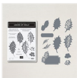
Leaves Of Holly Bundle (English) - 159608