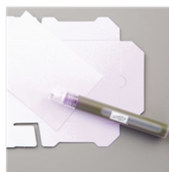
Stampin' Spritzer - 126185