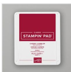
Cherry Cobbler Classic Stampin' Pad - 147083