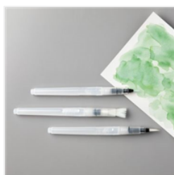
Water Painters - 151298