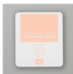
Petal Pink Classic Stampin' Pad - 147108