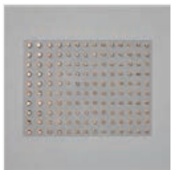
Champagne Rhinestone Basic Jewels - 151193