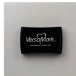
Versamark Pad - 102283