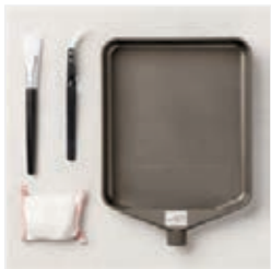
Embossing Additions Tool Kit - 159971