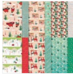
Santa Express 12" X 12" (30.5 X 30.5 Cm) Designer Series Paper - 159582