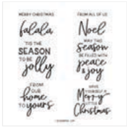
Framed & Festive Cling Stamp Set (English) - 160888

Tami White tami@stampwithtami.com www.stampwithtami.com