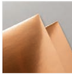
Copper Foil Sheets - 142020