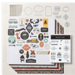
He's The Man Suite Collection (English) - 159083

Tami White tami@stampwithtami.com www.stampwithtami.com