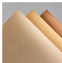
Brushed Metallic Cardstock - 153524