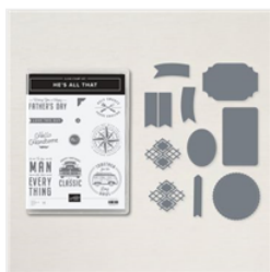
He's All That Bundle (English) - 159079