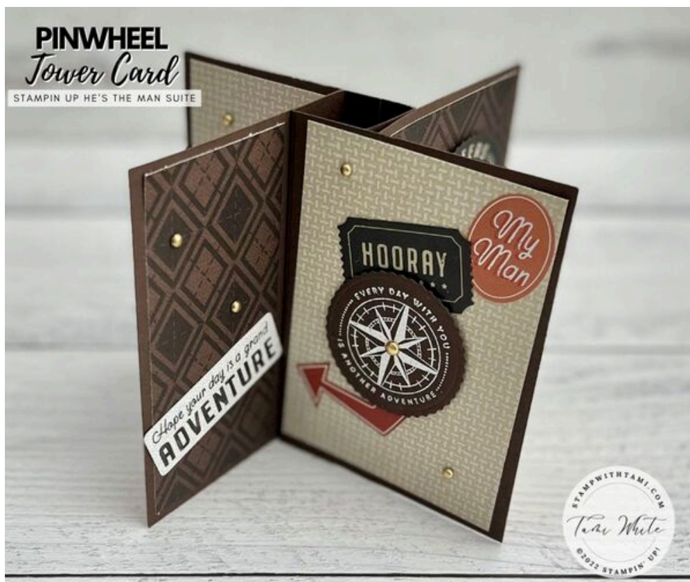
Card 8 in my Pinwheel Tower Card Series. See video for how to create the pinwheel tower fun fold cards.