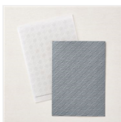
Gingham Embossing Folder - 157627