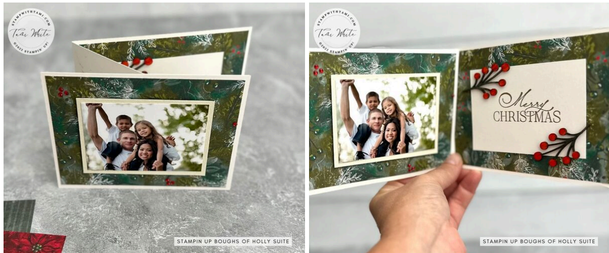
Card 23 in my series of Holiday Photo Cards. Cards 22-24 were created with the Stampin Up Boughs of Holly Suite.