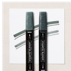
Evening Evergreen Stampin' Blends Combo Pack - 155517