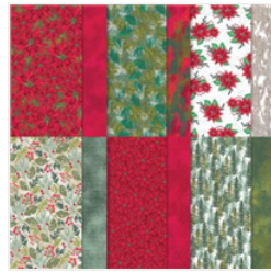
Boughs Of Holly 12" X 12" (30.5 X 30.5 Cm) Designer Series Paper - 159600