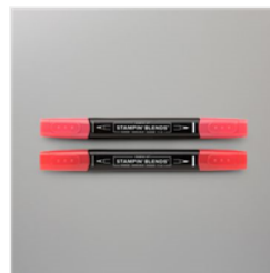
Poppy Parade Stampin' Blends Combo Pack - 154958