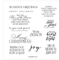
Brightest Glow Cling Stamp Set (English) - 159542