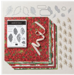
Boughs Of Holly Suite Collection (English) - 159612

Tami White tami@stampwithtami.com www.stampwithtami.com