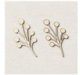
Textural Elements - 159966