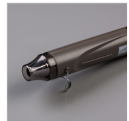
Heat Tool - 129053