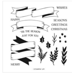
Christmas Banners Photopolymer Stamp Set (English) - 159570