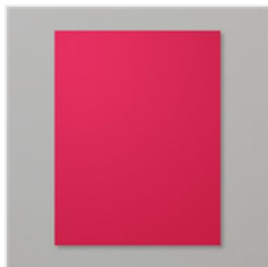
Real Red 8-1/2" X 11" Cardstock - 102482