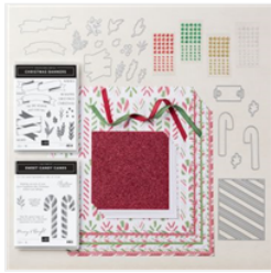
Sweetest Christmas Suite Collection (English) - 159579

Tami White tami@stampwithtami.com www.stampwithtami.com