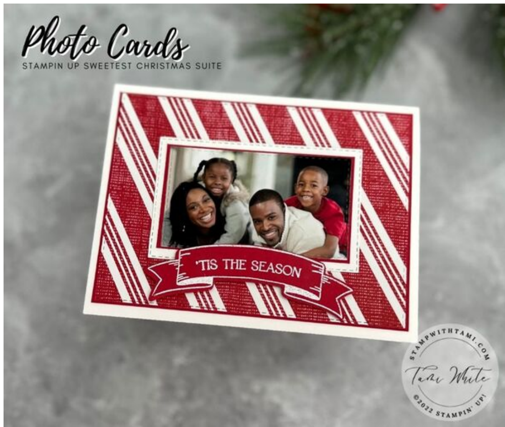
Cards 1 in my series of Holiday Photo Cards.