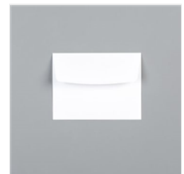
Basic White Medium Envelopes - 159236