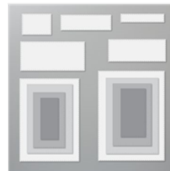
Rectangle Stitched Dies - 151820