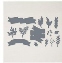
Christmas Banner Dies - 159576