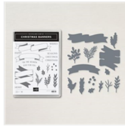
Christmas Banners Bundle (English) - 159993