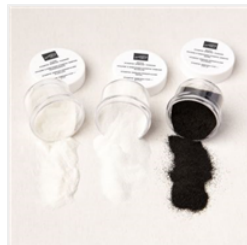
Basics Embossing Powders - 155554