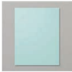
Pool Party 8-1/2" X 11" Cardstock - 122924