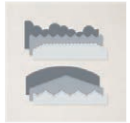
Basic Borders Dies - 155558