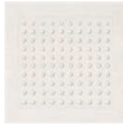
Opal Rounds - 154289