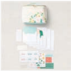
Nourish & Flourish Kit - 160230

Tami White tami@stampwithtami.com www.stampwithtami.com