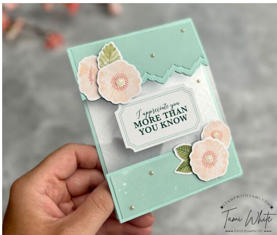
Card 5 in my Nourish and Flourish kit alternate series. See the blog post for a video to help making the floating card.