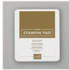
Soft Suede Classic Stampin' Pad - 147115