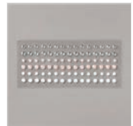
Elegant Faceted Gems - 152464