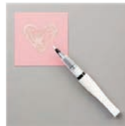
Wink Of Stella Clear Glitter Brush - 141897