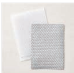
Hive 3D Embossing Folder - 157955