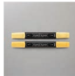
Daffodil Delight Stampin' Blends Combo Pack - 154883