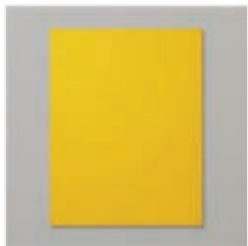
Crushed Curry 8- 1/2" X 11" Cardstock - 131199