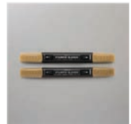
Soft Suede Stampin' Blends Combo Pack - 154906