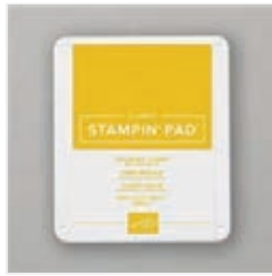
Crushed Curry Classic Stampin' Pad - 147087