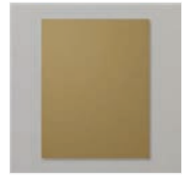
Soft Suede 8-1/2" X 11" Cardstock - 115318