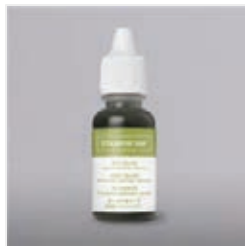
Old Olive Classic Stampin' Ink Refill - 100531