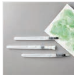
Water Painters - 151298