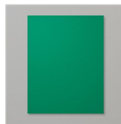
Shaded Spruce 8- 1/2" X 11" Cardstock - 146981