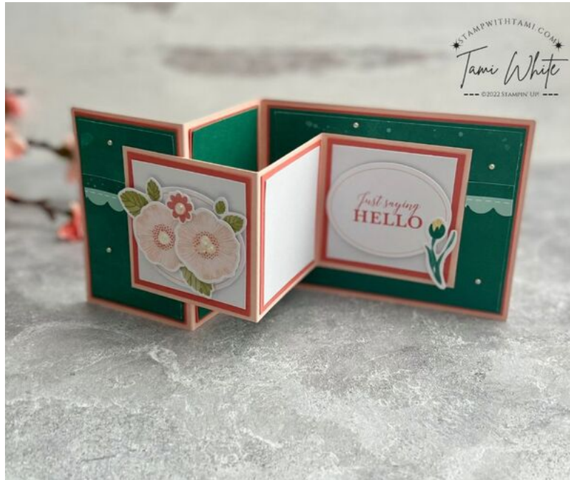
Card 4 in my Nourish and Flourish kit alternate series. See the blog post for help making the Double Z Fold Card.