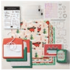
Santa Express Suite Collection (English) - 159597

Tami White tami@stampwithtami.com www.stampwithtami.com