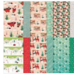
Santa Express 12" X 12" (30.5 X 30.5 Cm) Designer Series Paper - 159582