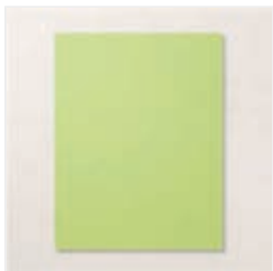
Parakeet Party 8-1/2" X 11" Cardstock - 159259