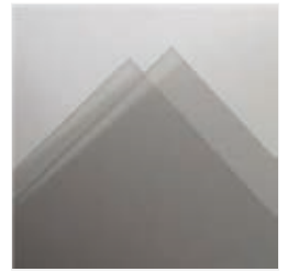
Window Sheets - 142314