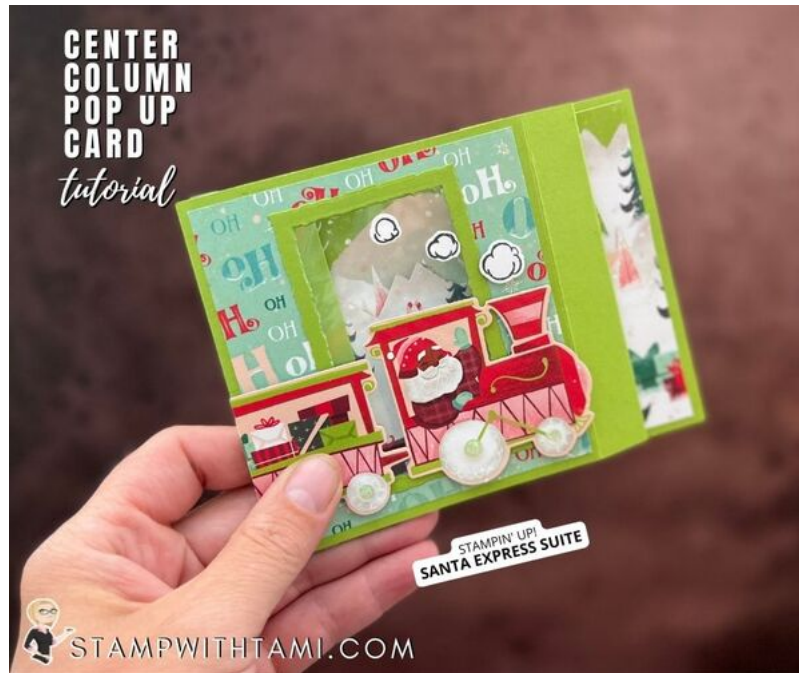
Card 15 in my Center Column Pop Up Fun Fold Series. See video for how to do this fold.