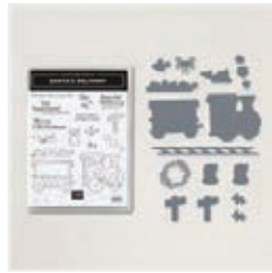
Santa's Delivery Bundle (English) - 159590