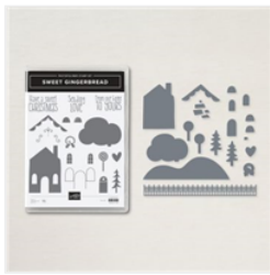
Sweet Gingerbread Bundle (English) - 159719

Tami White tami@stampwithtami.com www.stampwithtami.com