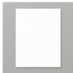
Shimmery White 8- 1/2" X 11" Cardstock - 101910