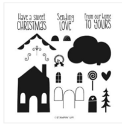
Sweet Gingerbread Photopolymer Stamp Set (English) - 159714