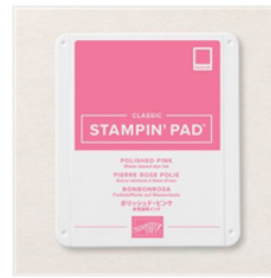
Polished Pink Classic Stampin' Pad - 155712