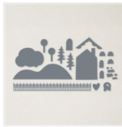
Gingerbread House Dies - 159718