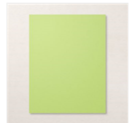
Parakeet Party 8- 1/2" X 11" Cardstock - 159259