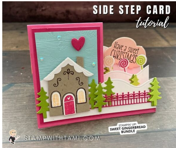
Card 8 in my Side Step Series. See template and video for how to do this fold.