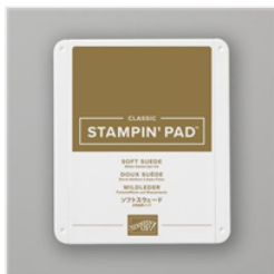
Soft Suede Classic Stampin' Pad - 147115