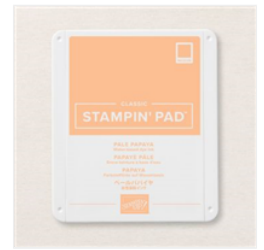
Pale Papaya Classic Stampin' Pad - 155670