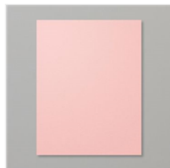
Blushing Bride 8- 1/2" X 11" Cardstock - 131198