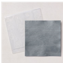
Into The Clouds Embossing Folder - 159171