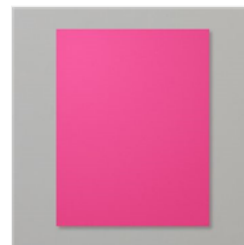
Melon Mambo 8- 1/2" X 11" Cardstock - 115320