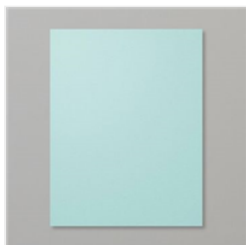
Pool Party 8-1/2" X 11" Cardstock - 122924