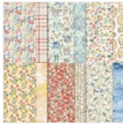
Rings Of Love 12" X 12" (30.5 X 30.5 Cm) Designer Series Paper - 159939