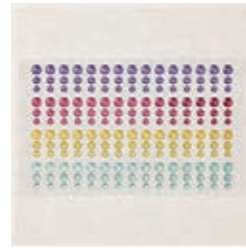
Glossy Dots Assortment - 158827