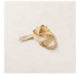
Gold 3/8" (1 Cm) Shimmer Ribbon - 156470