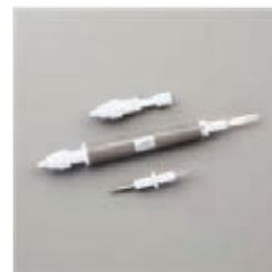
Take Your Pick - 144107