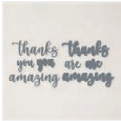
Amazing Thanks Dies (English) - 157816

Tami White tami@stampwithtami.com www.stampwithtami.com