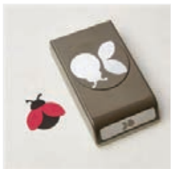
Ladybug Builder Punch - 157698