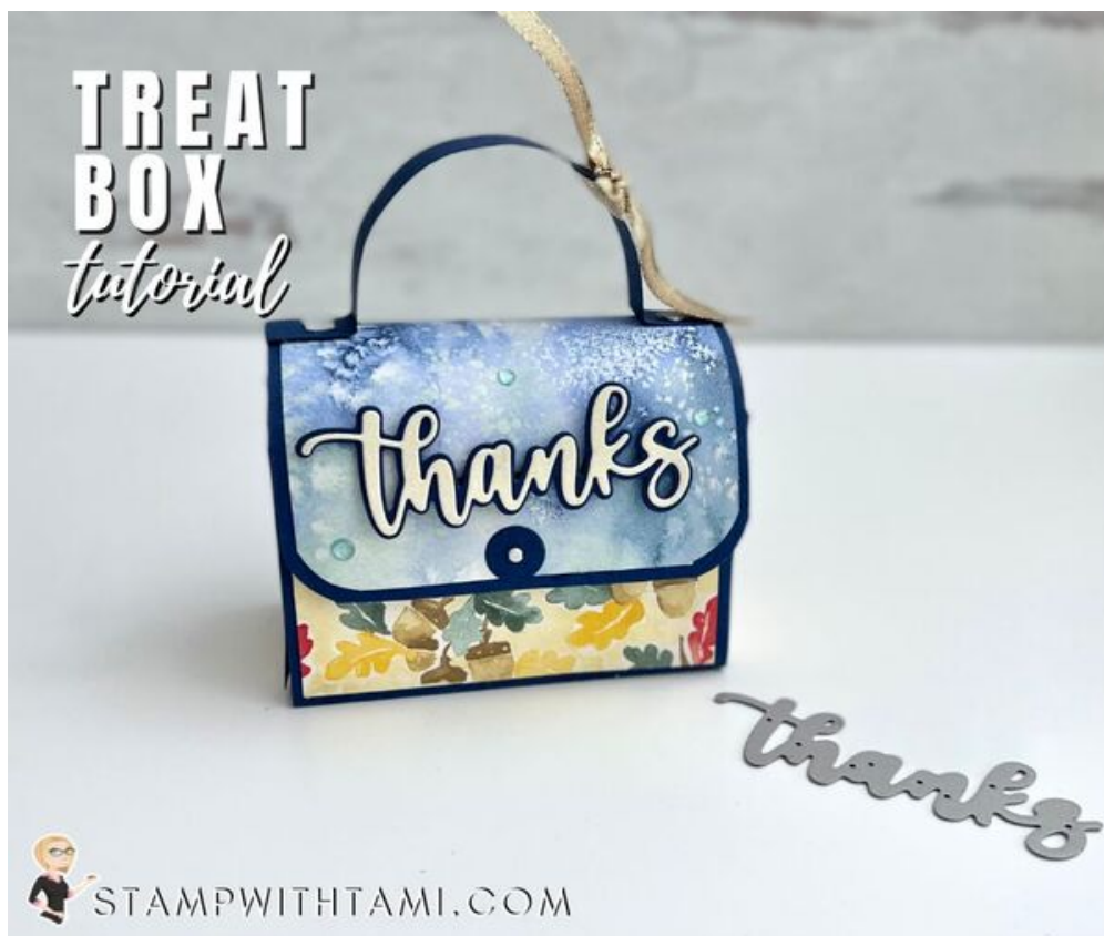
Box #3 in my Treat Box Series. See video for how to do create this.