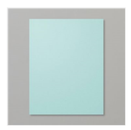
Pool Party 8-1/2" X 11" Cardstock -122924