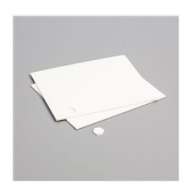
Stampin' Dimensionals -104430