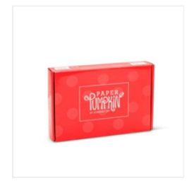
Prepaid Paper Pumpkin Subscription 1-Month - 137858

Tami White tami@stampwithtami.com www.stampwithtami.com