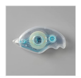
Stampin' Seal -152813