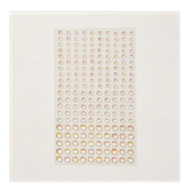
Iridescent Rhinestones Basic Jewels - 158130