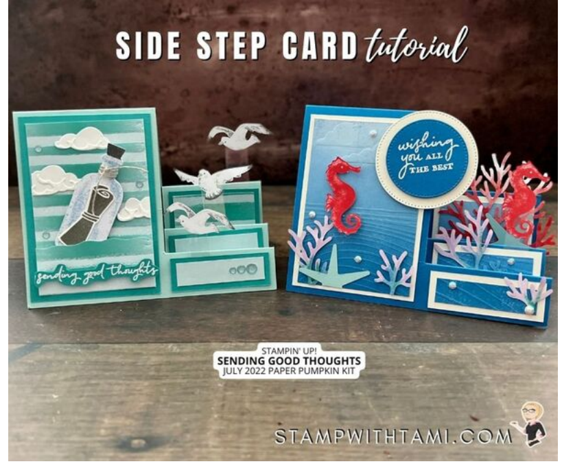
Cards 1 & 2 in my Side Step Series. See template and video for how to make pop up cards.