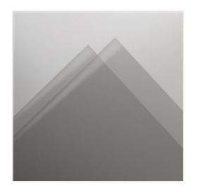
Window Sheets - 142314