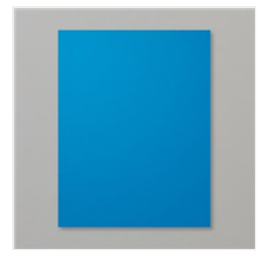
Pacific Point 8-1/2" X 11" Cardstock -111350