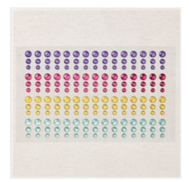
Glossy Dots Assortment -158827