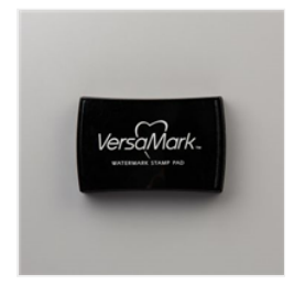
Versamark Pad - 102283