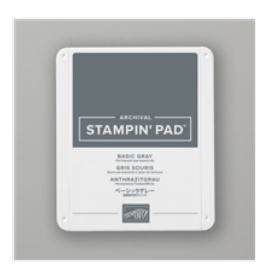
Basic Gray Classic Stampin' Pad -149165