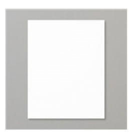
Basic White 8-1/2" X 11" Cardstock -159276