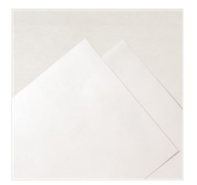
Pearlescent Specialty Paper -154291