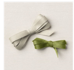
Old Olive & Sahara Sand Twill Ribbon Combo Pack - 158955