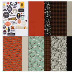
He's The Man 12" X 12" (30.5 X 30.5 Cm) Specialty Designer Series Paper - 159068