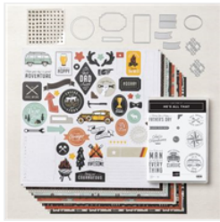
He's The Man Suite Collection (English) - 159083

Tami White tami@stampwithtami.com www.stampwithtami.com