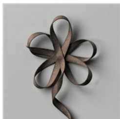
Early Espresso 1/4" (6.4 Mm) Faux Suede Trim - 152472