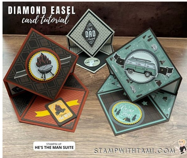
Cards 9-11 in my Diamond Easel Series. See the video and template for help with the fold.