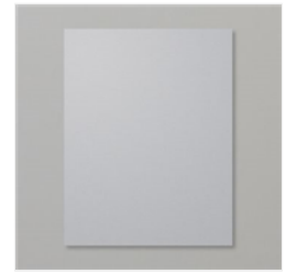
Smoky Slate 8-1/2" X 11" Cardstock - 131202