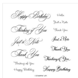
Go To Greetings Cling Stamp Set (English) - 158763