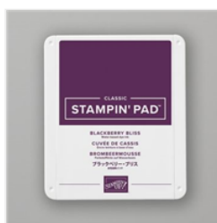
Blackberry Bliss Classic Stampin' Pad - 147092