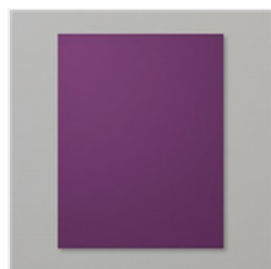
Blackberry Bliss 8- 1/2" X 11" Cardstock - 133675