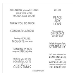
Inspired Thoughts Cling Stamp Set - 155536

Tami White tami@stampwithtami.com www.stampwithtami.com