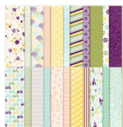
Design A Daydream 12" X 12" (30.5 X 30.5 Cm) Host Designer Series Paper - 159161