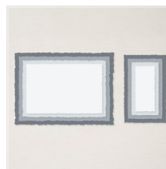
Deckled Rectangles Dies - 159173