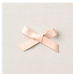
Petal Pink 3/8" (1 Cm) Soft Polyester Ribbon - 159192