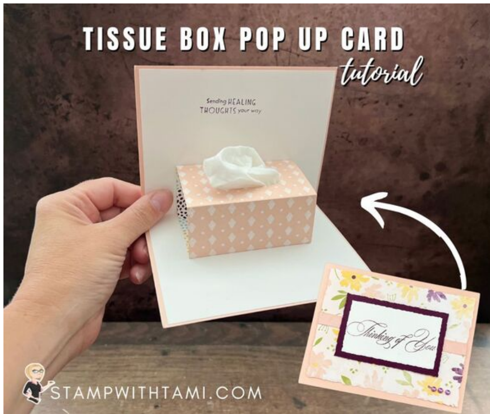
Card 7 in my Pop Up Series.