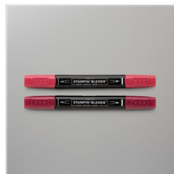
Cherry Cobbler Stampin' Blends Combo Pack - 154880