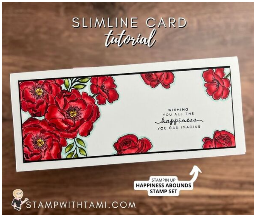
Card 7 of my Hues of Happiness Suite Series. Visit my blog for more in this series.