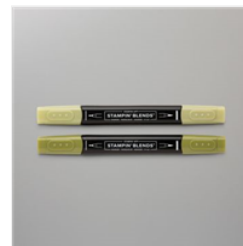
Old Olive Stampin' Blends Combo Pack - 154892