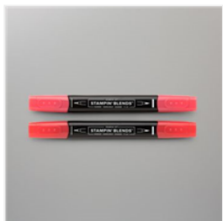
Poppy Parade Stampin' Blends Combo Pack - 154958