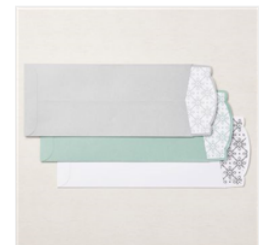
Slimline Envelopes - 157981