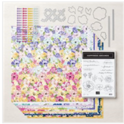
Hues Of Happiness Suite Collection (English) - 158828

Tami White tami@stampwithtami.com www.stampwithtami.com