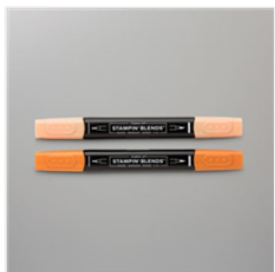
Pumpkin Pie Stampin' Blends Combo Pack - 154897