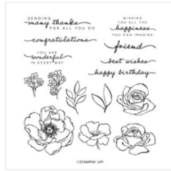
Happiness Abounds Photopolymer Stamp Set (English) - 159238