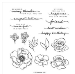
Happiness Abounds Photopolymer Stamp Set (English) - 159238