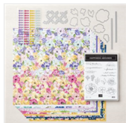
Hues Of Happiness Suite Collection (English) - 158828

Tami White tami@stampwithtami.com www.stampwithtami.com