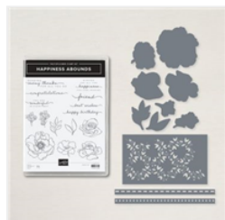
Happiness Abounds Bundle (English) - 158824