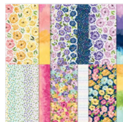
Hues Of Happiness 12" X 12" (30.5 X 30.5 Cm) Designer Series Paper - 158822