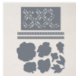
Blossoming Happiness Dies - 158823