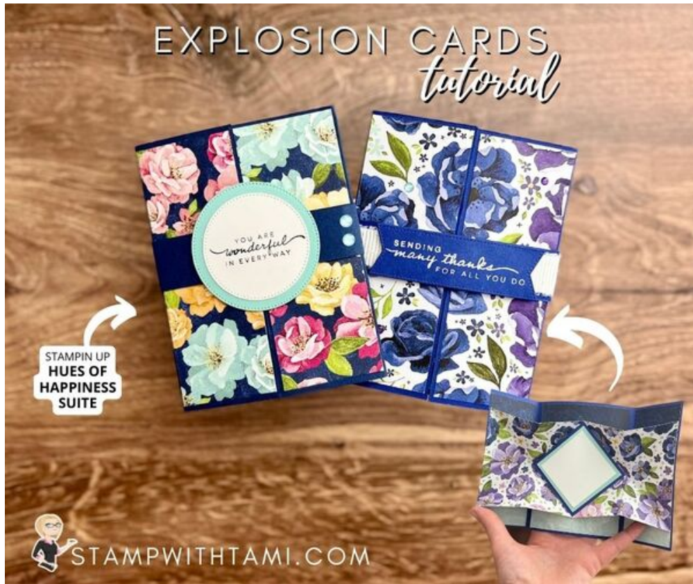
Cards 5 & 6 in my Hues of Happiness Card Series. VIEW VIDEO FOR HOW TO DO EXPLOSION CARD