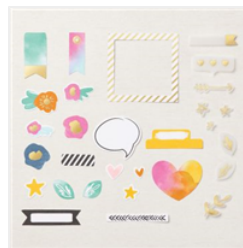
Abstract Beauty Ephemera Pack - 158151