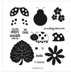
Hello Ladybug Photopolymer Stamp Set (English) - 157693