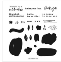
Hello Beautiful Photopolymer Stamp Set (English) - 158041