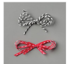
Playful Pets Trim Combo Pack - 152466