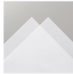
Vellum 8-1/2" X 11" Cardstock - 101856