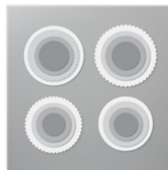
Layering Circles Dies - 151770