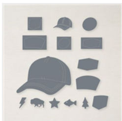
Hat Builder Dies - 155964