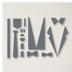
Suit & Tie Dies - 154322