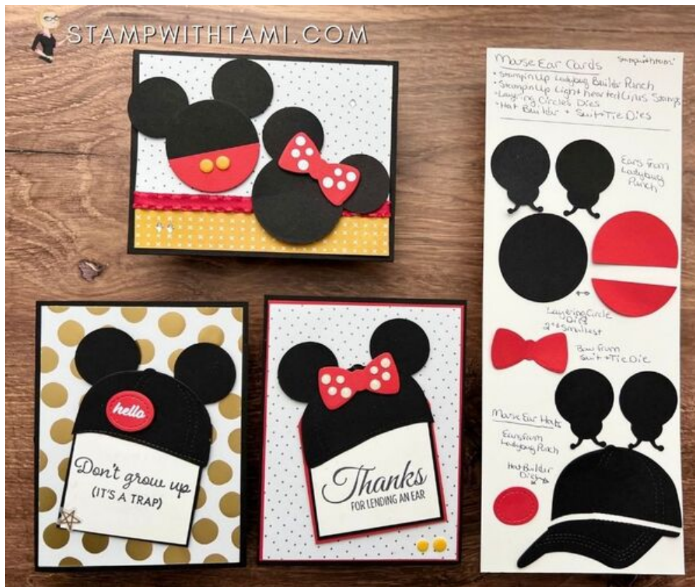
MOUSE EARS - CARDS #5-7 IN MY LADYBUG SERIES.