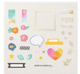
Abstract Beauty Ephemera Pack - 158151