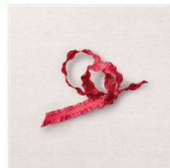
Real Red 3/8" (1 Cm) Mini Ruffled Ribbon - 156323