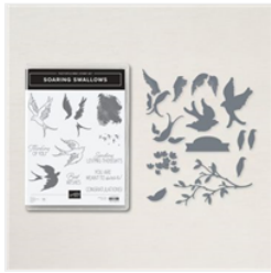
Soaring Swallows Bundle (English) - 157810

Tami White tami@stampwithtami.com www.stampwithtami.com