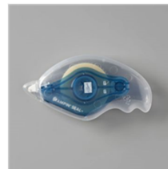
Stampin' Seal+ - 149699