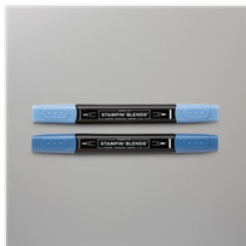
Night Of Navy Stampin' Blends Combo Pack - 154891