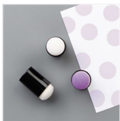
Sponge Daubers - 133773

Tami White tami@stampwithtami.com www.stampwithtami.com