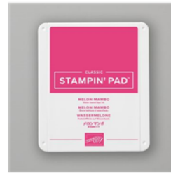
Melon Mambo Classic Stampin' Pad - 147051