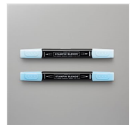
Balmy Blue Stampin' Blends Combo Pack - 154830