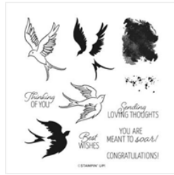
Soaring Swallows Photopolymer Stamp Set (English) - 157804