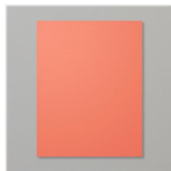
Calypso Coral 8- 1/2" X 11" Cardstock - 122925