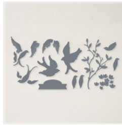
Swallows Dies - 157809