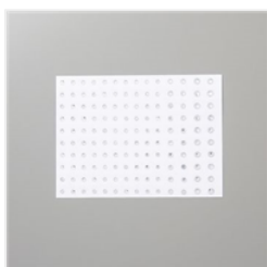
Rhinestone Basic Jewels - 144220