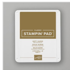
Soft Suede Classic Stampin' Pad - 147115