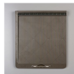
Simply Scored Scoring Tool - 122334