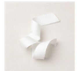
White 3/4" (1.9 Cm) Frayed Ribbon - 158138