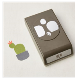
Cactus Builder Punch - 158057