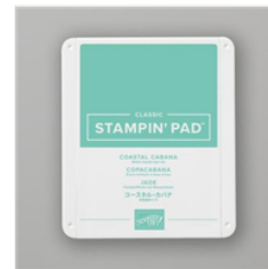
Coastal Cabana Classic Stampin' Pad - 147097