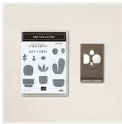
Cactus Cuties Bundle - 158058

Tami White tami@stampwithtami.com www.stampwithtami.com