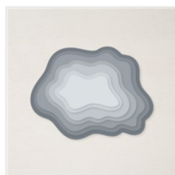
Layering Diorama Dies - 155565