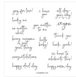
Happy & Heartfelt Cling Stamp Set (English) - 158005