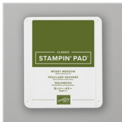
Mossy Meadow Classic Stampin' Pad - 147111