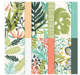
Artfully Composed 12" X 12" (30.5 X 30.5 Cm) Designer Series Paper - 157750