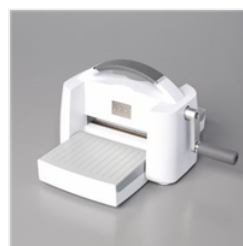
Stampin' Cut & Emboss Machine - 149653