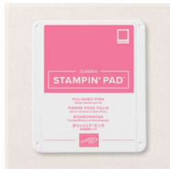
Polished Pink Classic Stampin' Pad - 155712