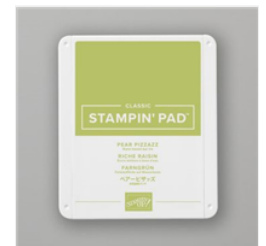
Pear Pizzazz Classic Stampin' Pad - 147104