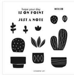
Cactus Cuties Photopolymer Stamp Set - 158056