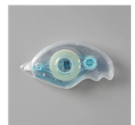
Stampin' Seal - 152813