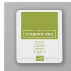
Old Olive Classic Stampin' Pad - 147090