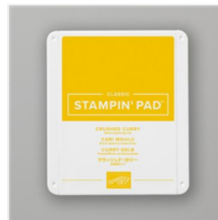
Crushed Curry Classic Stampin' Pad - 147087