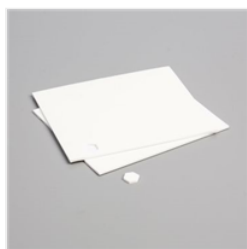
Stampin' Dimensionals - 104430