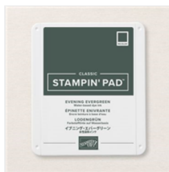
Evening Evergreen Classic Stampin' Pad - 155576