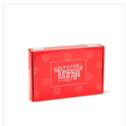
Prepaid Paper Pumpkin Subscription 1-Month - 137858

Tami White tami@stampwithtami.com www.stampwithtami.com