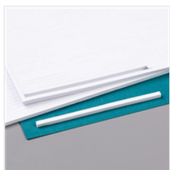
Foam Adhesive Strips - 141825