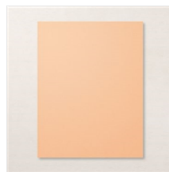
Pale Papaya 8- 1/2" X 11" Cardstock - 155668