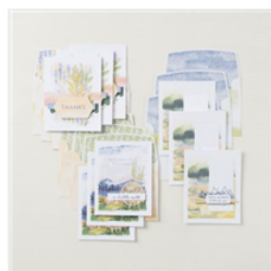
Beyond The Horizon Paper Pumpkin Refill - 160330