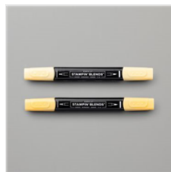
So Saffron Stampin' Blends Combo Pack - 154905