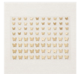
Brushed Brass Butterflies - 158136