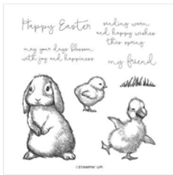
Easter Friends Cling Stamp Set (English) - 157737

Tami White tami@stampwithtami.com www.stampwithtami.com