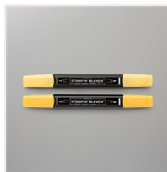
Daffodil Delight Stampin' Blends Combo Pack - 154883