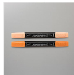
Pumpkin Pie Stampin' Blends Combo Pack - 154897