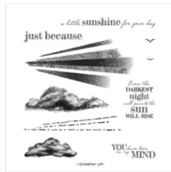
After The Storm Cling Stamp Set (English) - 155038