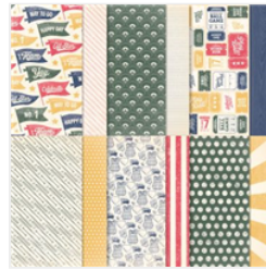
Hey Sports Fan 12" X 12" (30.5 X 30.5 Cm) Designer Series Paper - 157882