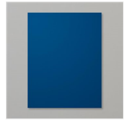
Night Of Navy 8-1/2" X 11" Cardstock - 100867