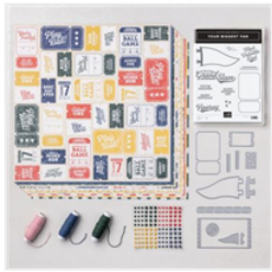
Hey Sports Fan-Suite Collection (English) - 157896

Tami White tami@stampwithtami.com www.stampwithtami.com