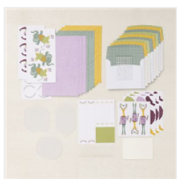
Safari Celebration Paper Pumpkin Refill - 160220