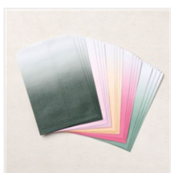
Ombre Gift Bags - 155479