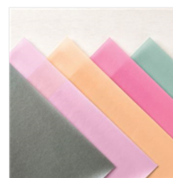
2021-2023 In Color Shimmer Vellum - 155616