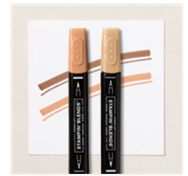
Stampin' Blends Medium Combo - 159462