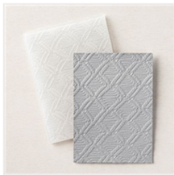
Macrame 3D Embossing Folder - 155435