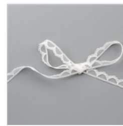
Very Vanilla 3/8" (1 Cm) Scalloped Lace Trim - 149593