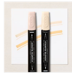
Stampin' Blends Medium Light Combo Pack - 159463