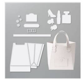
All Dressed Up Dies - 151665