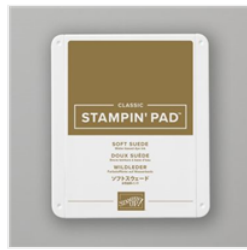
Soft Suede Classic Stampin' Pad - 147115