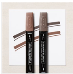
Stampin' Blends Deep Combo Pack - 158152