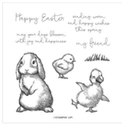
Easter Friends Cling Stamp Set (English) - 157737

Tami White tami@stampwithtami.com www.stampwithtami.com