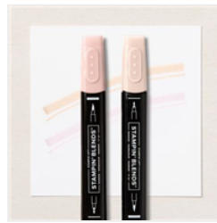
Stampin' Blends Light Combo Pack - 159465