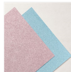
Supple Shimmer 12" X 12" (30.5 X 30.5 Cm) Specialty Paper - 158068