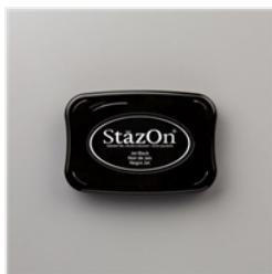
Jet Black Stazon Pad - 101406