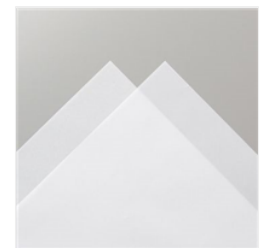
Vellum 8-1/2" X 11" Cardstock - 101856