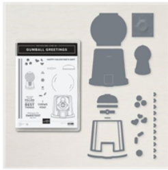
Gumball Greetings Bundle - 157648

Tami White tami@stampwithtami.com www.stampwithtami.com