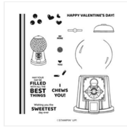
Gumball Greetings Photopolymer Stamp Set - 157646