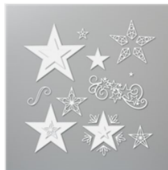
Stitched Stars Dies - 150653