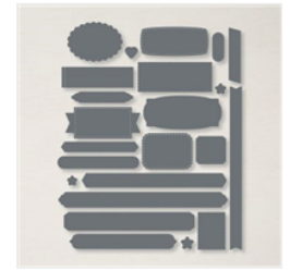
Messages Die - 154422