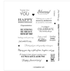
Many Messages Cling Stamp Set - 154510