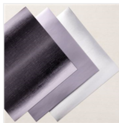
Silver Foil 12" X 12" (30.5 X 30.5 Cm) Specialty Pack - 156457