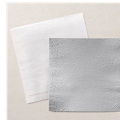
Timber 3D Embossing Folder - 156406