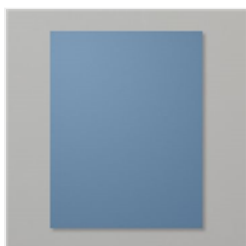
Misty Moonlight 8-1/2" X 11" Cardstock - 153081