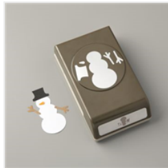
Snowman Builder Punch - 150643