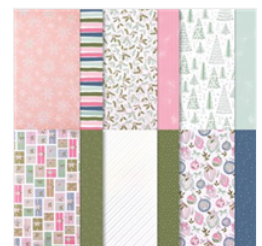
Whimsy & Wonder 12" X 12" (30.5 X 30.5 Cm) Specialty Designer Series Paper - 156329