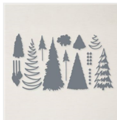
Christmas Trees Dies - 156339