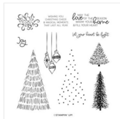
Whimsical Trees Cling Stamp Set (English) - 156330