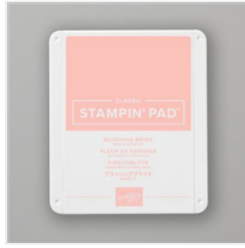
Blushing Bride Classic Stampin' Pad - 147100