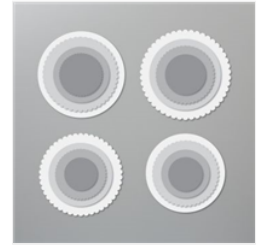
Layering Circles Dies - 151770