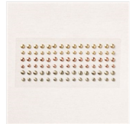
Brushed Metallic Adhesive Backed Dots - 156506