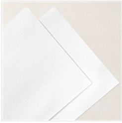
Snowy White 12" X 12" (30.5 X 30.5 Cm) Velvet Sheets - 156405

Tami White tami@stampwithtami.com www.stampwithtami.com