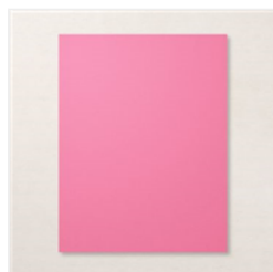
Polished Pink 8-1/2" X 11" Cardstock - 155710