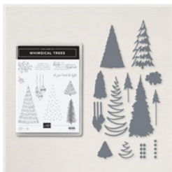
Whimsical Trees Bundle (English) - 156810

Create a coordinating envelope using a 7-1/2" x 7-1/2" piece of Whimsy & Wonder Specialty Designer Series Paper. Place the card diagonally on the center of the paper. Fold in the side edges (3-1/2" edges of card). Fold up the bottom long edge and use Stampin' SEAL or Stampin' SEAL+ to adhere the bottom flap to the side flaps (don't adhere to the card!). Add Stampin' SEAL to the edge of the remaining flap and seal closed. Add adhesive labels for adding an address if mailing.