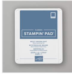
Misty Moonlight Classic Stampin' Pad - 153118