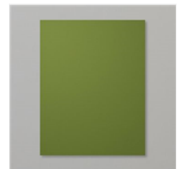
Mossy Meadow 8-1/2" X 11" Cardstock - 133676