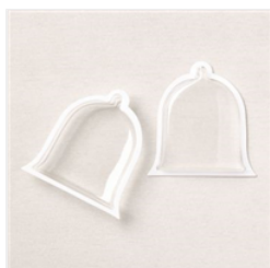
Cloche Shaker Domes - 156387