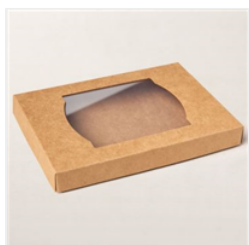
Kraft Gift Boxes - 156569