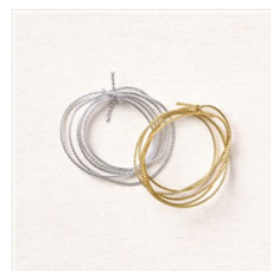
Simply Elegant Trim - 155766