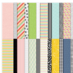
Pattern Party 12" X 12" (30.5 X 30.5 Cm) Host Designer Series Paper - 155426