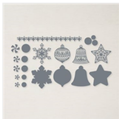
Gingerbread Dies - 156320