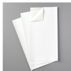
Adhesive Sheets - 152334