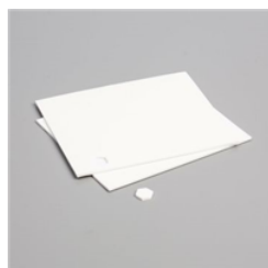
Stampin' Dimensionals - 104430