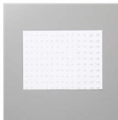
Pearl Basic Jewels - 144219