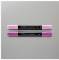
Blackberry Bliss Stampin' Blends Combo Pack - 154877

Tami White tami@stampwithtami.com www.stampwithtami.com