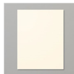
Very Vanilla 8-1/2" X 11" Cardstock - 101650