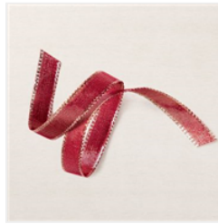
Cherry Cobbler & Gold 1/2" (1.3 Cm) Metallic Ribbon - 156312