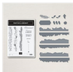
Festive & Bright Bundle - 156566

Tami White tami@stampwithtami.com www.stampwithtami.com