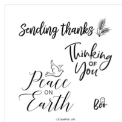
Thinking Thanks & Peace Cling Stamp Set (English) - 156552