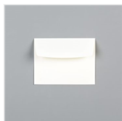
Very Vanilla Medium Envelopes - 107300