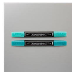
Bermuda Bay Stampin' Blends Combo Pack - 154878