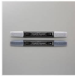
Basic Black Stampin' Blends Combo Pack - 154843