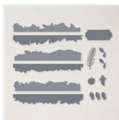
Festive Finishes Dies - 156565