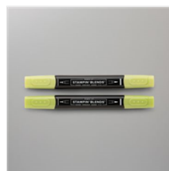
Granny Apple Green Stampin' Blends Combo Pack - 154885