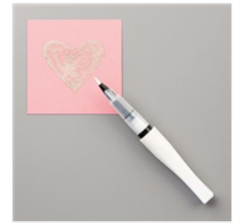
Wink Of Stella Clear Glitter Brush - 141897