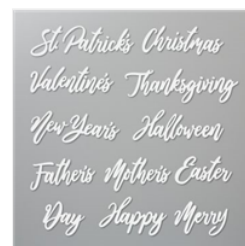
Word Wishes Dies (En) - 149629