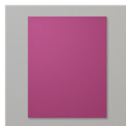
Rich Razzleberry 8-1/2" X 11" Cardstock - 115316