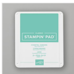
Coastal Cabana Classic Stampin' Pad