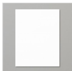
Basic White 8-1/2" X 11" Cardstock