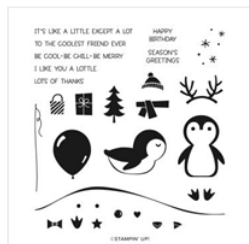
Penguin Place Photopolymer Stamp Set (English)