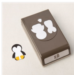
Penguin Builder Punch