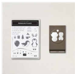
Penguin Place Bundle (English)