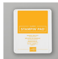
Mango Melody Classic Stampin' Pad