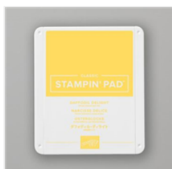
Daffodil Delight Classic Stampin' Pad