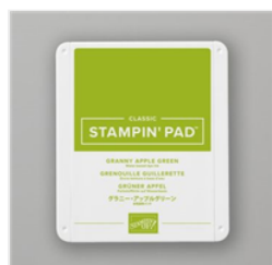
Granny Apple Green Classic Stampin' Pad