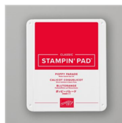
Poppy Parade Classic Stampin' Pad