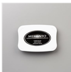
Tuxedo Black Memento Ink Pad