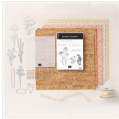
Harvest Meadow Suite Collection (English)