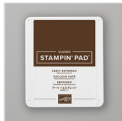
Early Espresso Classic Stampin' Pad