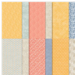
Harvest Meadow 12" X 12" (30.5 X 30.5 Cm) Designer Series Paper