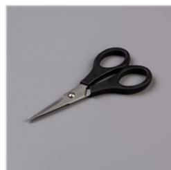
Paper Snips Scissors