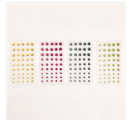
Decorative Matte Dots