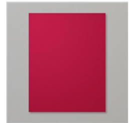
Cherry Cobbler 8-1/2" X 11" Cardstock