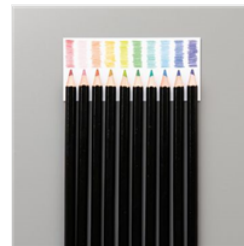
Watercolor Pencils Assortment 2