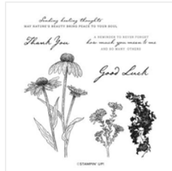
Nature's Harvest Cling Stamp Set (English)