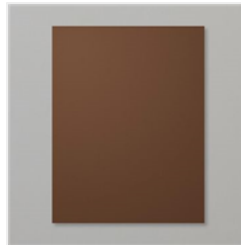
Early Espresso 8-1/2" X 11" Cardstock