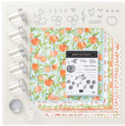
You're A Peach Suite Collection (English) - 155831