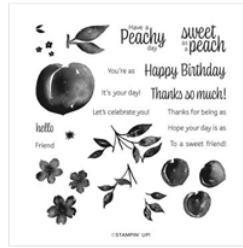
Sweet As A Peach Photopolymer Stamp Set - 155050