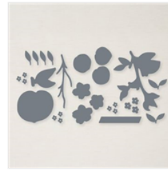
Peach Dies - 155829