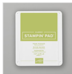
Pear Pizzazz Classic Stampin' Pad - 147104