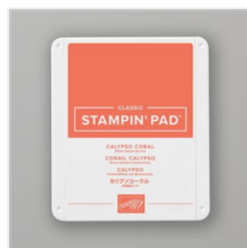
Calypso Coral Classic Stampin' Pad - 147101