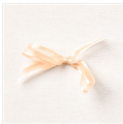
Pale Papaya 3/8" (1 Cm) Open Weave Ribbon - 155672