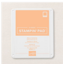
Pale Papaya Classic Stampin' Pad - 155670