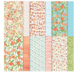
You're A Peach 12" X 12" (30.5 X 30.5 Cm) Designer Series Paper - 155686