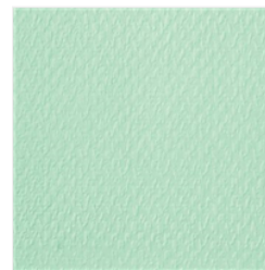
Tasteful Textile 3D Embossing Folder - 152718