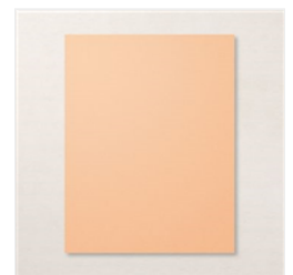
Pale Papaya 8-1/2" X 11" Cardstock - 155668