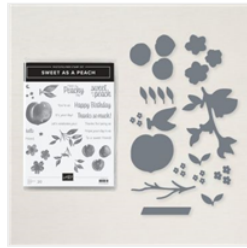
Sweet As A Peach Bundle (English) - 155823