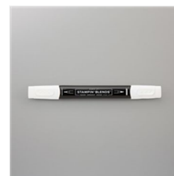
Stampin' Blends Color Lifter - 144608