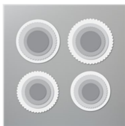
Layering Circles Dies - 151770