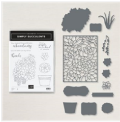
Simply Succulents Bundle - 156264