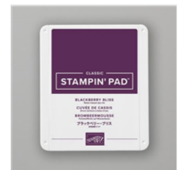
Blackberry Bliss Classic Stampin' Pad - 147092