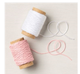
Snail Mail Twine Combo Pack - 154579