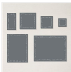
Stitched With Whimsy Dies - 155314