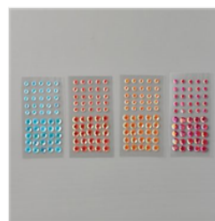
Artistry Blooms Adhesive-Backed Sequins - 152477