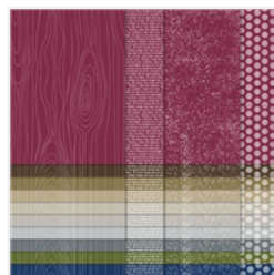
Neutrals 6" X 6" (15.2 X 15.2 Cm) Designer Series Paper - 152485