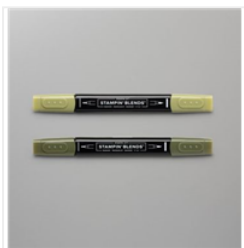
Mossy Meadow Stampin' Blends Combo Pack - 148547