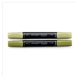
Old Olive Stampin' Blends Combo Pack - 144597