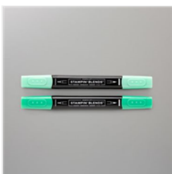
Shaded Spruce Stampin' Blends Combo Pack - 147938