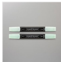
Mint Macaron Stampin' Blends Markers Combo Pack - 147283