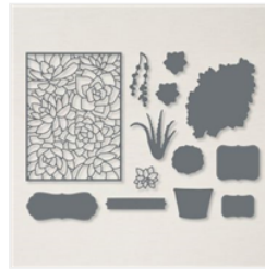
Potted Succulents Dies - 154330