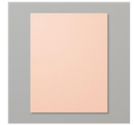
Petal Pink 8-1/2" X 11" Cardstock - 146985