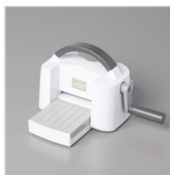
Mini Stampin' Cut & Emboss Machine - 150673