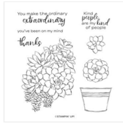
Simply Succulents Cling Stamp Set - 154480