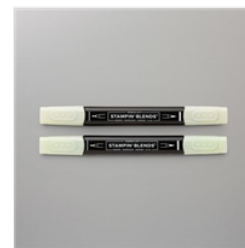
Soft Sea Foam Stampin' Blends Markers Combo Pack - 148059