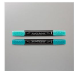
Bermuda Bay Stampin' Blends Combo Pack - 144600