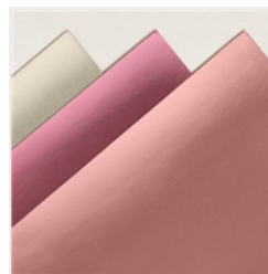
Love You Always Foil Sheets - 154286