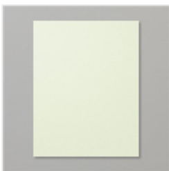
Soft Sea Foam 8-1/2" X 11" Cardstock - 146988