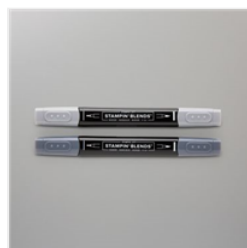
Basic Black Stampin' Blends Combo Pack - 154843