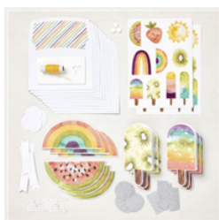
So Cool Paper Pumpkin Refill - 157092