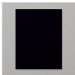
Basic Black 8-1/2" X 11" Cardstock - 121045