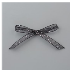
Black 3/8" (1 Cm) Glittered Organdy Ribbon - 147897