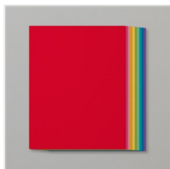
Brights 8-1/2" X 11" Cardstock - 146975