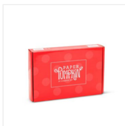
Prepaid Paper Pumpkin Subscription 1- Month - 137858