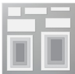
Rectangle Stitched Dies - 151820