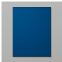
Night Of Navy 8- 1/2" X 11" Cardstock - 100867