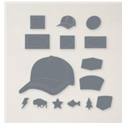
Hat Builder Dies - 155964