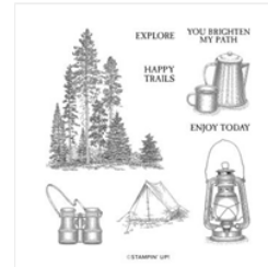
Campology Cling Stamp Set - 152553