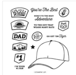
Hats Off Photopolymer Stamp Set - 155483