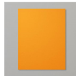
Pumpkin Pie 8-1/2" X 11" Cardstock - 105117