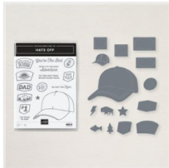
Hats Off Bundle - 158361