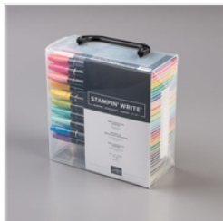
Many Marvelous Markers - 147154