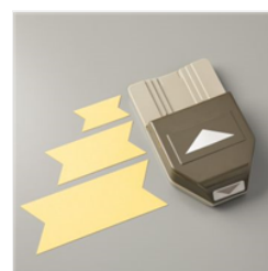
Triple Banner Punch - 138292