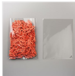
6" X 8" (15.2 X 20.3 Cm) Cellophane Bags - 102210