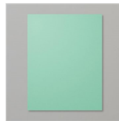
Coastal Cabana 8-1/2" X 11" Cardstock - 131297