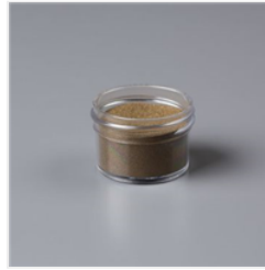
Gold Stampin' Emboss Powder - 109129