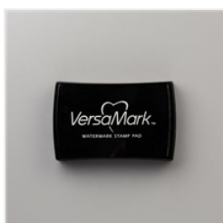
Versamark Pad - 102283