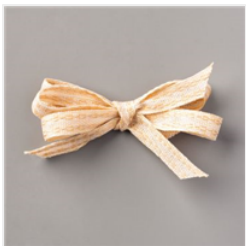
3/8" (1 Cm) Embroidered Ribbon - 153554