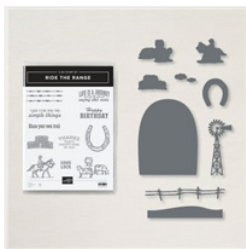
Ride The Range Bundle - 156243