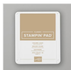
Crumb Cake Classic Stampin' Pad - 147116