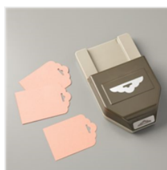
Scalloped Tag Topper Punch - 133324