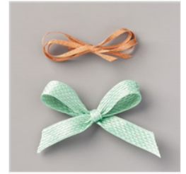
Basketweave & Metallic Ribbon Combo Pack - 153553