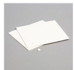
Mini Stampin' Dimensionals - 144108