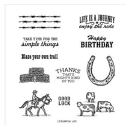
Ride The Range Cling Stamp Set - 154553