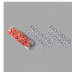
3" X 9" (7.6 X 22.9 Cm) Printed Gusseted Cellophane Bags - 151312