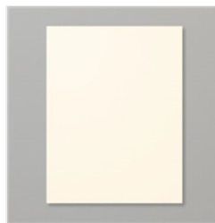
Very Vanilla 8-1/2" X 11" Cardstock - 101650