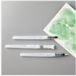
Water Painters - 151298