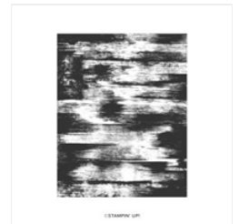
Drybrush Cling Stamp Set - 152599