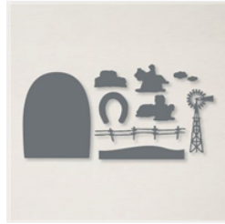
Open Range Dies - 154323