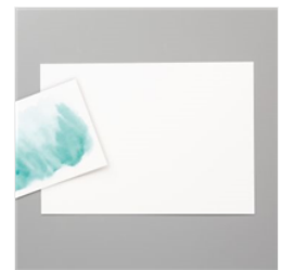
Fluid 100 Watercolor Paper - 149612