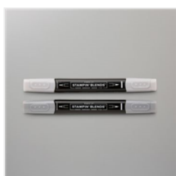
Smoky Slate Stampin' Blends Combo Pack - 154904