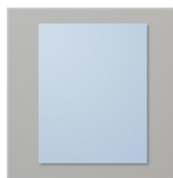
Seaside Spray 8-1/2" X 11" Cardstock - 150883