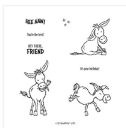
Darling Donkeys Cling Stamp Set - 155264

Tami White tami@stampwithtami.com www.stampwithtami.com