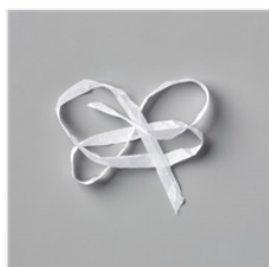
Whisper White 1/4" (6.4 Mm) Crinkled Seam Binding Ribbon - 151326