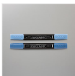
Night Of Navy Stampin' Blends Combo Pack - 154891