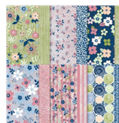
Paper Blooms 12" X 12" (30.5 X 30.5 Cm) Designer Series Paper - 155222