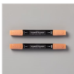
Cinnamon Cider Stampin' Blends Combo Pack - 153105