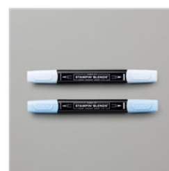
Seaside Spray Stampin' Blends Combo Pack - 154901