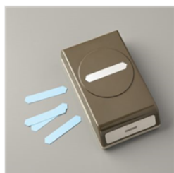
Classic Label Punch - 141491