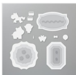
Hippo & Friends Dies - 153585