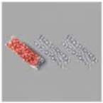
3" X 9" (7.6 X 22.9 Cm) Printed Gusseted Cellophane Bags 151312