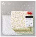
Poinsettia Place Suite Collection (English) 155109