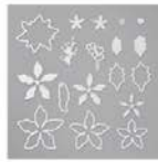
Poinsettia Dies 153522