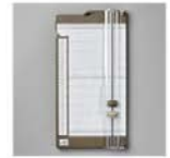
Paper Trimmer 152392