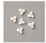
Beaded Pearls 153534