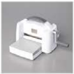
Stampin' Cut & Emboss Machine 149653