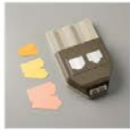
Lovely Labels Pick A Punch 152883