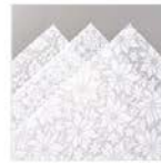
Plush Poinsettia Specialty Paper 153486