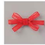
Real Red 3/8" (1 Cm) Sheer Ribbon 153535