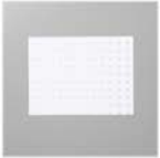
Pearl Basic Jewels 144219