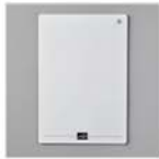
Magnetic Cutting Plate 149656