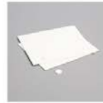
Stampin' Dimensionals 104430