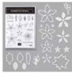
Poinsettia Petals Bundle (English) 155148