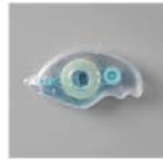
Stampin' Seal 152813