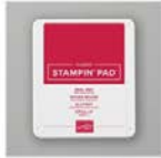
Real Red Classic Stampin' Pad 147084