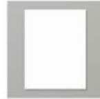
Whisper White 8-1/2" X 11" Cardstock 100730