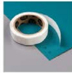
Glue Dots 103683