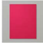
Real Red 8-1/2" X 11" Cardstock 102482