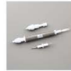
Take Your Pick 144107