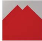
Red Velvet Paper 153490